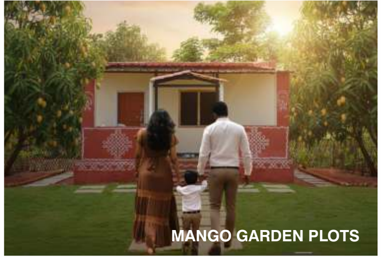
MANGO GARDEN PLOTS